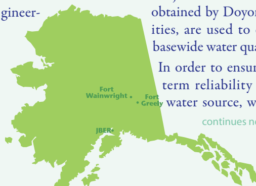
Doyon Utilities operates and provides utility service for the United States Army in Alaska at Fort Wainwright, Fort Greely and JBER (Joint Base Elmendorf-Richardson).