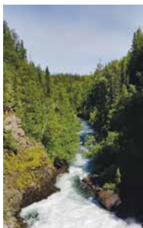
Upper Ship Creek provides the drinking water for the JBER water system.

by an interconnected set of computers. Because groundwater is a very high quality source of raw water, the only treatment necessary is disinfection. Each groundwater well is equipped with its own in-line chlorination equipment to ensure that water enters the distribution system free from any microbial contamination. The finished water is tested several times a day to ensure that pH, chlorine residuals, and fluoride are at appropriate levels.