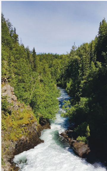
Upper Ship Creek provides the drinking water for the JBER water system.

The JBER water plant is designed to produce seven million gallons of water per day. During 2021, Doyon Utilities produced over 1 billion gallons of water, making them one of the largest water producers in the state!